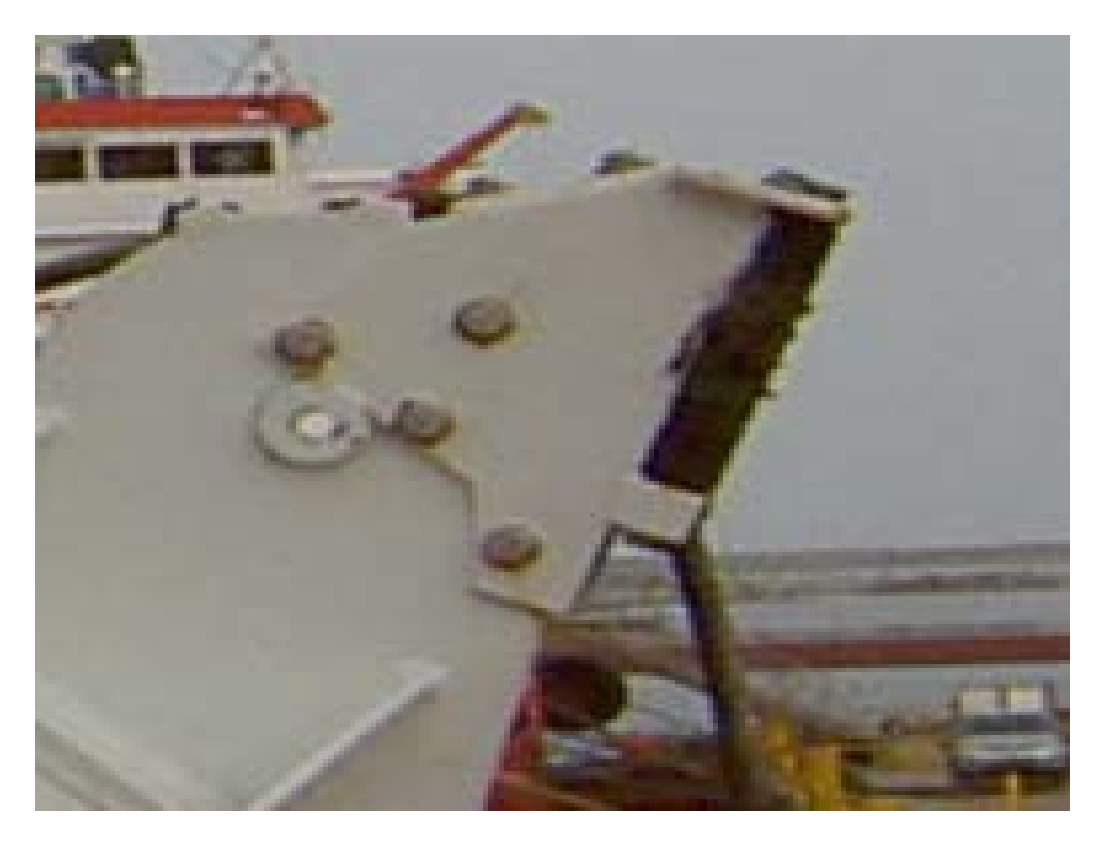
Davit with extension bracket, inboard with FRC stowed